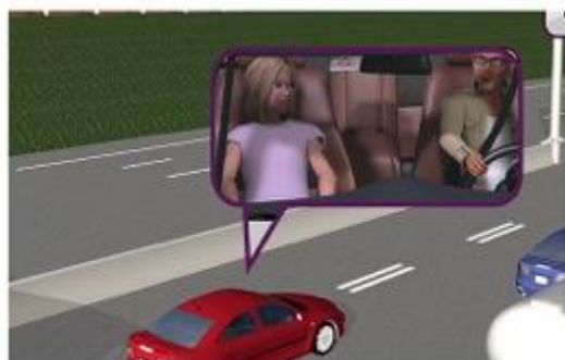
Optional bubble of inside car shot showing two people in car with tag.