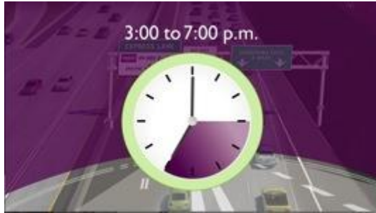
Animated clock graphics with traffic in background. NOTE: Spinning of hands, but need to highlight periods of time on clock with copy.

VO: MnPASS peak-drive times are weekdays from 6:00 o'clock to 10:00 o'clock in the morning and 3:00 o'clock to 7:00 o'clock in the afternoon.