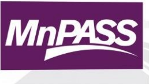
Video Footage: :07-:15 (:08 available)