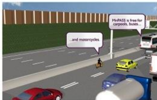
Fade or pan camera down to close up of bus, motorcycle with bubble copy (existing video).