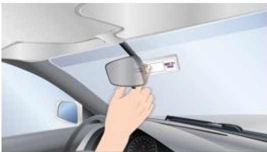
Static shots of sticker tag: 3-4 illustrations of application to windshield.

during peak drive times. The fees to use the lanes are automatically deducted from a prepaid MnPASS account.