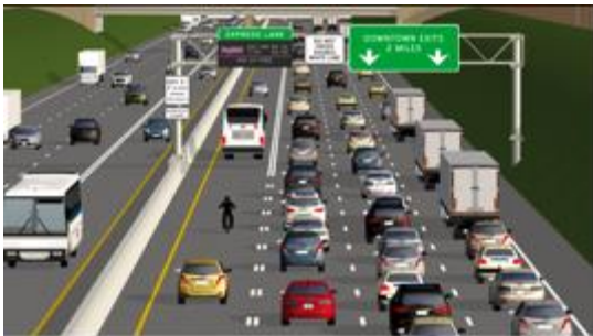
Intro segment fading to car merging into MnPASS lane. Need to show heavier traffic – both ways. And in the MnPASS lanes NOTE: New vantage point.