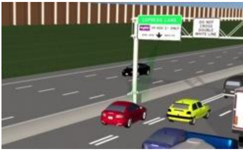
Closer shot of simulated tag scan