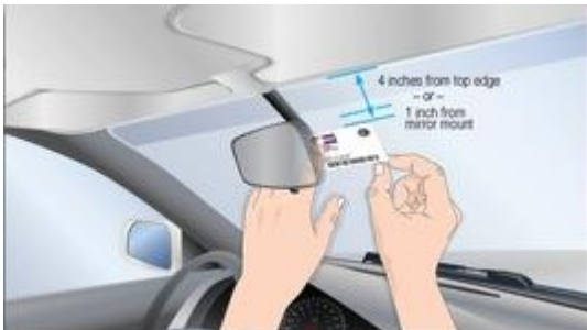
Static shots of sticker tag: 3-4 illustrations of application to windshield.